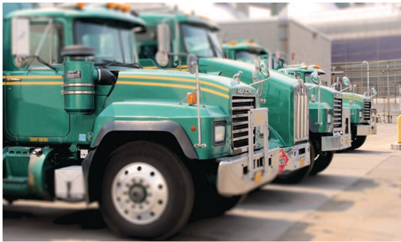
PRINTED BY UNITED METRO ENERGY CORP. ALL RIGHTS RESERVED. SS-WT-715